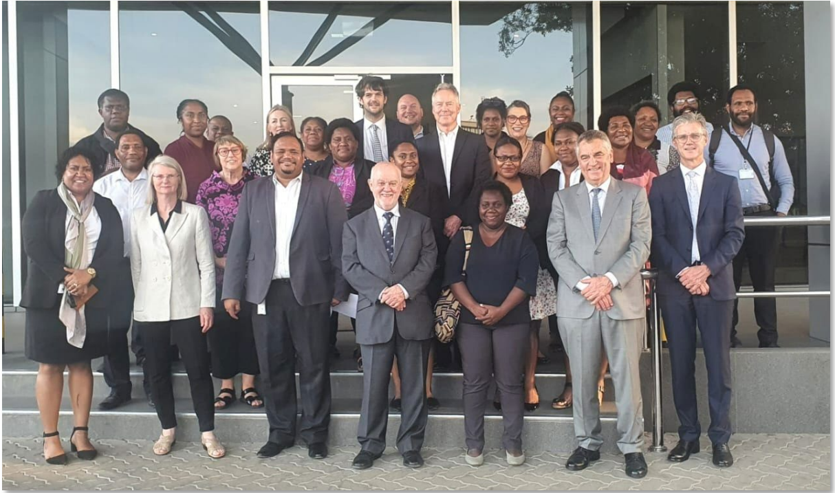
The Office of Solicitor General