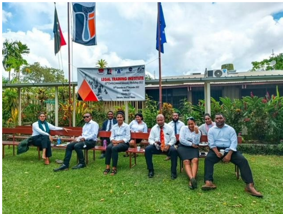
Some of the LTI Students during a break