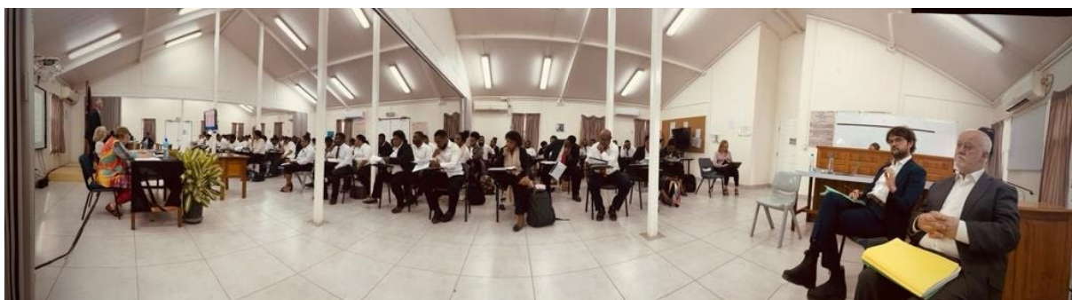
Students during the Individual Performances and teaching sessions

At the completion of each student performance, the student is provided with a review by the Advocacy Trainers.