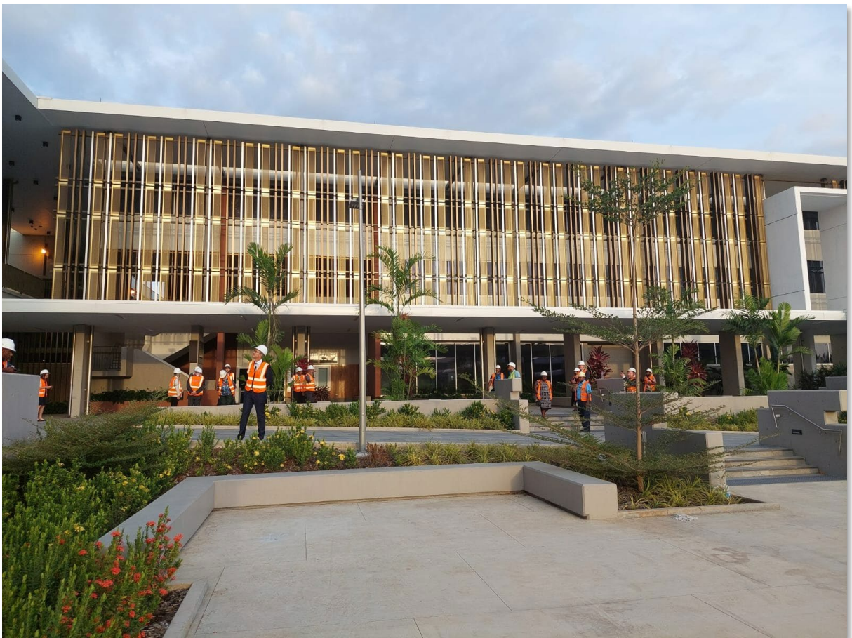
Tour of the new PNG Supreme Court precinct under construction